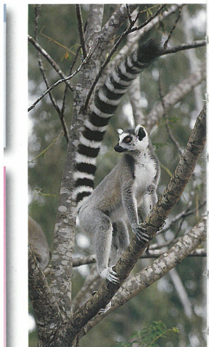
▲ Ring-tailed Lemur, Madagascar. The island of Madagascar has wonderful forests and some of its wildlife is unique. But several species are under threat of extinction.

from the air. The River falls into a narrow gorge. si-oo-tunya – 'the smoke that' – named after the English Queen Victoria and Livingstone . The falls are wide and over 100 metres high. Livingstone and Zambia , which at the bottom of the image.