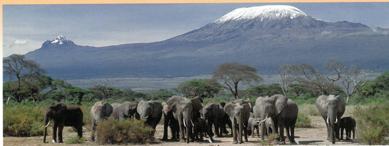
▲ Mount Kilimanjaro, Tanzania. Africa's highest mountain is the beautiful cone of an old volcano. It is near the Equator, but high enough to have snow all year.

The population of this area is growing fast. It has doubled in less than 25 years. Some of these countries have the world's highest population growth rates, and more than half the population is young.