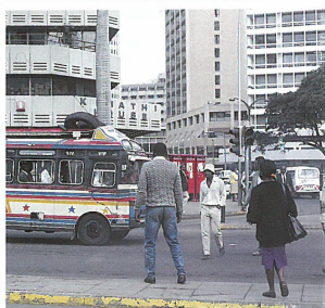
started to be built in the 19th century and became the capital in 1960. Before that, no town had ever been there.

Tea will grow in the cooler mountains. The leaves are picked by hand. It is hard work in hot sunshine.