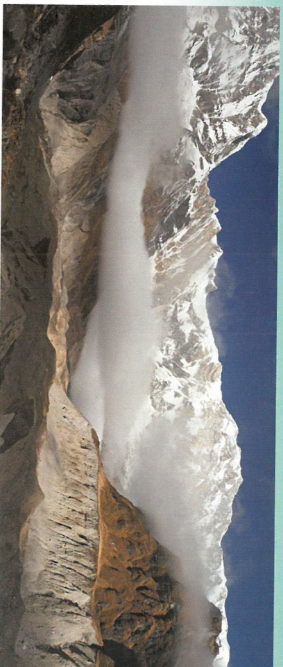
▲ Himalayan Mountains, Nepal. The photograph shows Annapurna I. Annapurna I is 8078 metres high and was first climbed in 1950. There are four other peaks in the group that are over 7500 metres high. The Himalayas are the world's highest mountain range, containing all the world's 'top ten' highest peaks, including Mount Everest.