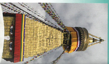
▲ This Buddhist shrine is like many found in Nepal. It has been decorated with prayer flags and painted eyes.

Over half the world's population lives in Asia. Seven of the world's 'top ten' most populated countries are here (see page 9). The coastal areas of south and east Asia are the most crowded parts. But people in these areas are in danger from typhoons or cyclones (also called hurricanes) and tsunamis (huge waves caused by earthquakes under the sea).