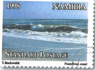
▲ The Atlantic Ocean washes the desert shore of Namibia, in southern Africa.

The green expanse across northern Europe and northern Asia is the world's biggest plain.