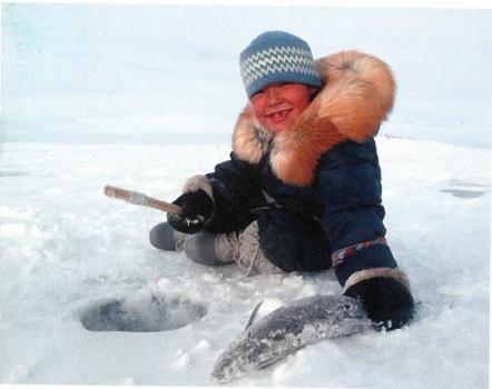
▲ Inuit (Eskimo) boy fishing for cod through a hole in the ice. Fish are a good source of protein for families in the far north. This boy lives in Nunavik in northern Canada.