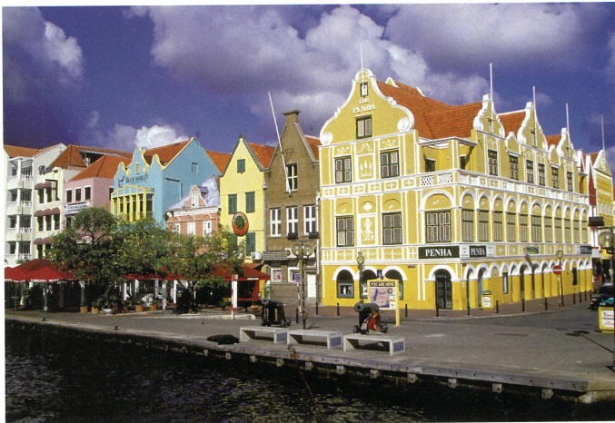
▲ Dutch colonial houses, Curaçao. The island of Curaçao has been Dutch for many years. The colonists came from the Netherlands, and tried to build houses just like the ones at home. Several other small West Indian islands still have European connections.

In recent years, many West Indians have emigrated to the UK from Commonwealth islands, to France from Guadeloupe and Martinique, and to the USA from Puerto Rico. The most important crops for export are tobacco, sugar, bananas and special fruit such as nutmegs from Granada. A few islands have developed their minerals, for example bauxite in Jamaica and oil in Trinidad.