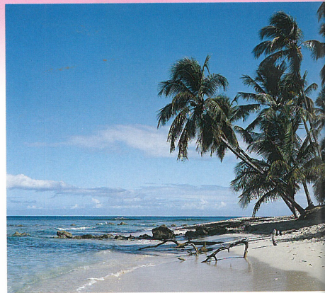
▲ Coconut palms and beach, Barbados. It is beautiful – but beware! The tropical sun can quickly burn your skin. And if you seek shade under the coconut palms, you might get hit by a big coconut! Even so, the West Indies are very popular with tourists – especially Americans escaping from cold winters.