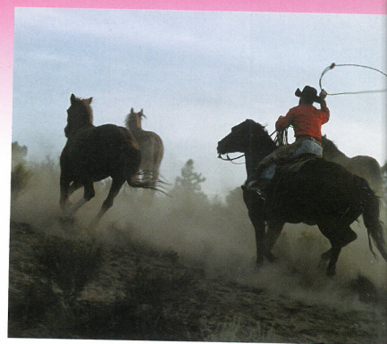
▲ The 'Wild West'. Scenes like this one are rare now, except when they are put on for the many tourists who visit the area. But in the days of the 'Wild West', 100 years or more ago, the skills of cowboys were vital for rounding up the cattle that roamed over vast unfenced areas.

The only big city on the high plateaus west of the Rockies is Salt Lake City, Utah, which was settled by the Mormons. Some former mining towns are now 'ghost towns': when the mines closed, all the people left. The toughest area of all is the desert land of Arizona in the south-west. The mountains and deserts were a great problem to the pioneers, but today the spectacular scenery and wildlife are preserved in large national parks.