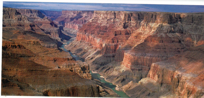
▲ Grand Canyon, Arizona. The Colorado River has cut a huge canyon 1½ kilometres deep and several kilometres wide in this desert area of the USA. The mountains slowly rose, while the river kept carving a deeper valley.