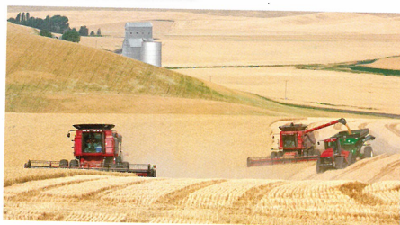
▲ Wheat harvest, USA. Huge combine harvesters move across a field of wheat. In the distance is the grain store. Up to 150 years ago, this land was covered in grass and grazed by buffaloes.