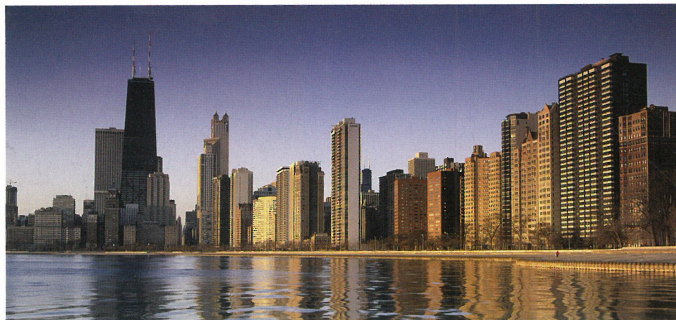
▲ Skyscrapers in Chicago , the biggest inland city in the USA. The world's first skyscraper was built here in 1885. These skyscrapers look out over Lake Michigan. The lake shore can freeze over in winter.