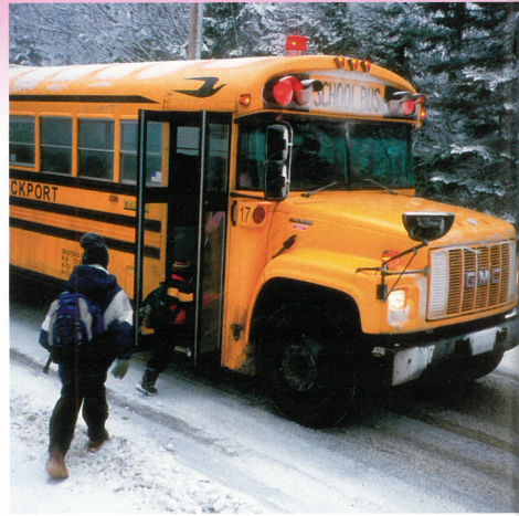
▲ The school bus in New Hampshire. The north-east corner of the USA is called New England and was settled by English colonists. The settlers named their towns and villages after places they had known in England. This bus is taking the children to school in the snow!

The Appalachian Mountains are beautiful, especially in the autumn (fall), when the leaves turn red. But this area is the poorest part of the USA. Coal mines have closed and farmland is poor. The good farmland is west of the Appalachians, where you can drive for many kilometres past fields of wheat and sweetcorn.