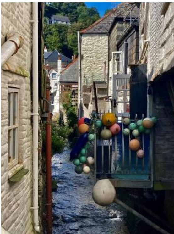
Poppy G, 7A