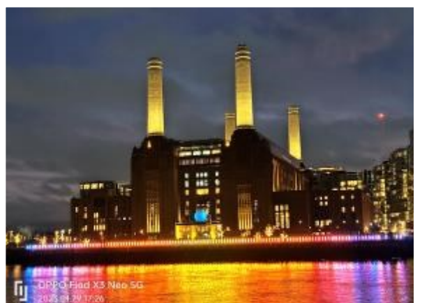
Poppy F, 7F