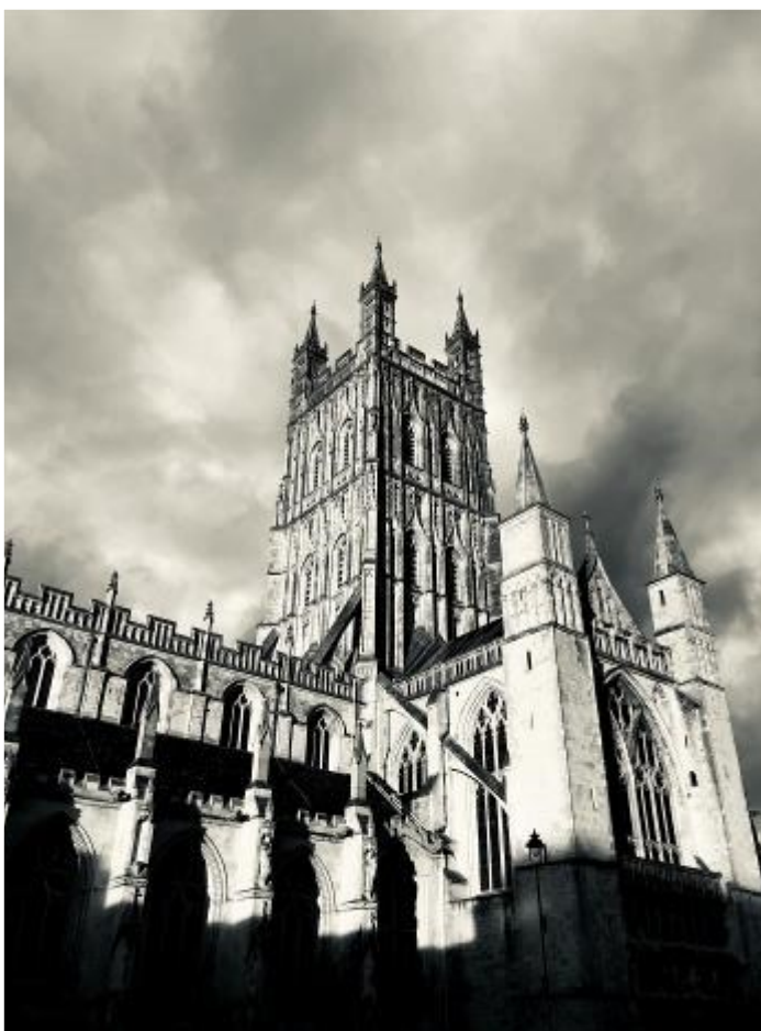
Eliza T, 9B

The Rotary panel tackled the difficult job of judging the winners from the photographs submitted by all schools taking part. They were very impressed with the creative talents of Eliza and Lakota and the beautiful images they captured to reflect the competition theme.