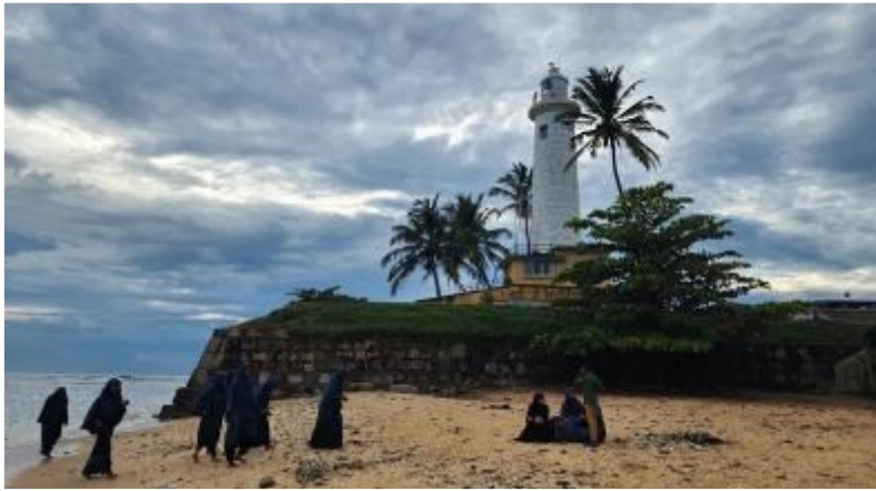
Cameron P, 7F