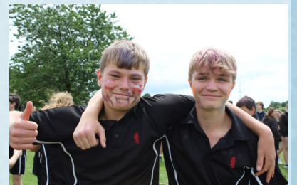
Pictured below: our pupils at Year 7 & 8 Sports Afternoon on 19th July 2023