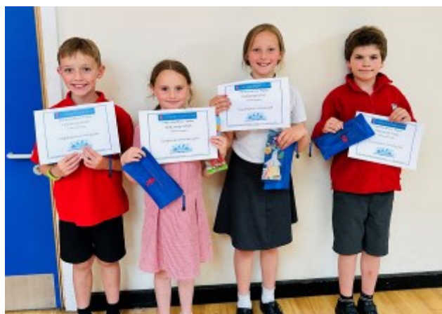
The winning team from Stratton Primary